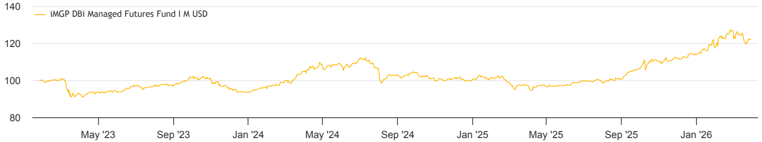
Past performance does not predict future returns. Returns may increase or decrease as a result of currency fluctuations for non-USD investors.