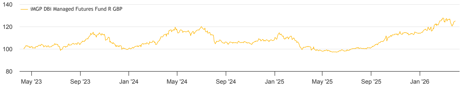
Past performance does not predict future returns. Returns may increase or decrease as a result of currency fluctuations for non-USD investors.